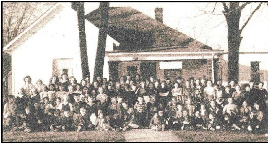
The Bloomington Day Nursery, MCUM's earliest incarnation, was started in a house on West 11th Street that has since been torn down. This photo dates from the early 1940's.