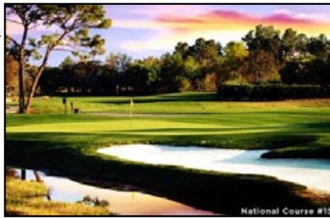
Enjoy a five-night stay in a villa at the Omni Orlando ChampionsGate Resort. See page 5 for more auction items!

With generous sponsorships from local businesses and government, all proceeds will benefit low-income children in need of quality early childhood education and Monroe County families without safety nets that need help during a financial crisis.